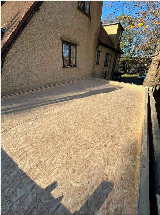
Rooflight detail IMG-20260218-WA0025.jpg