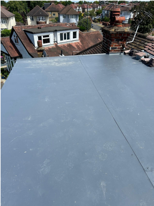
Rooflight detail IMG-20260218-WA0033.jpg