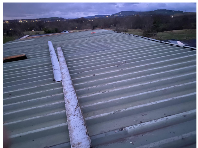
Roof surface condition / progress view IMG-20260218-WA0015.jpg