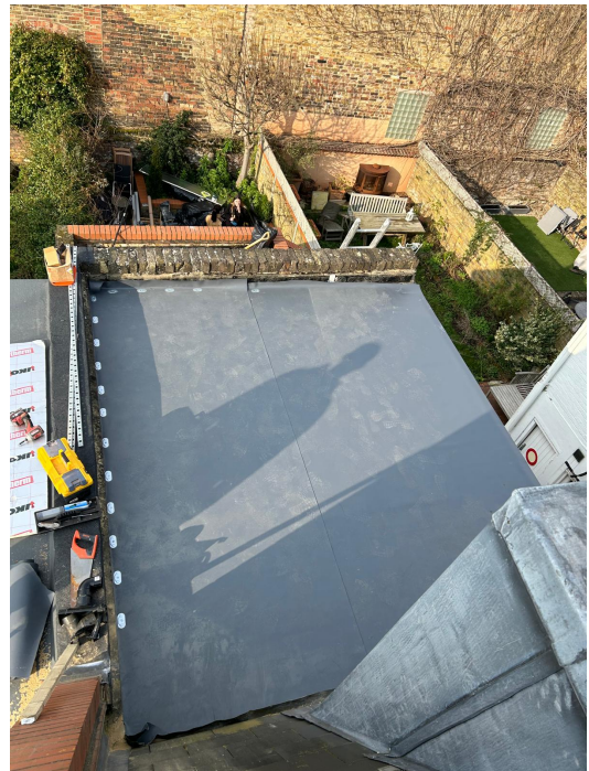
Roof surface condition / progress view IMG-20260218-WA0030.jpg