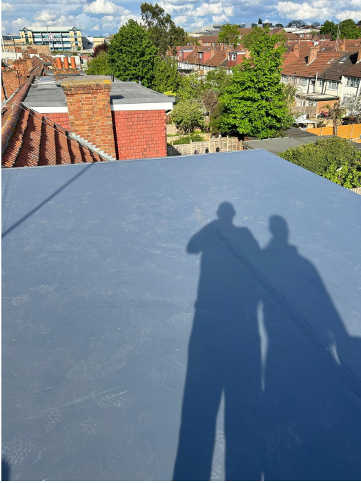
Completed membrane area IMG-20260218-WA0031.jpg