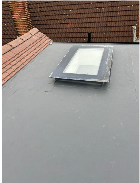
Edge / upstand detail IMG-20260218-WA0034.jpg