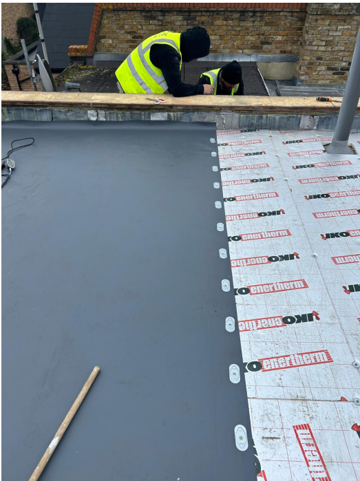
General roof overview IMG-20260218-WA0029.jpg