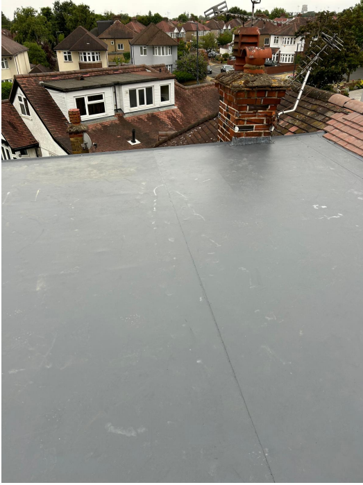
Completion overview IMG-20260218-WA0035.jpg