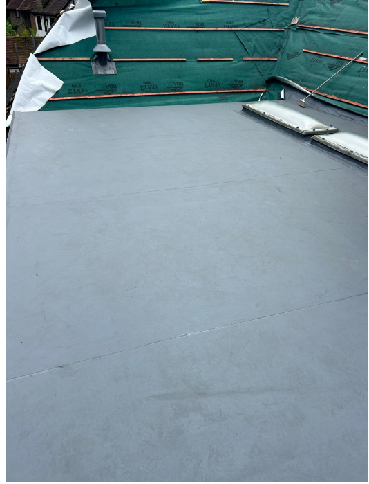
Progress view IMG-20260218-WA0036.jpg