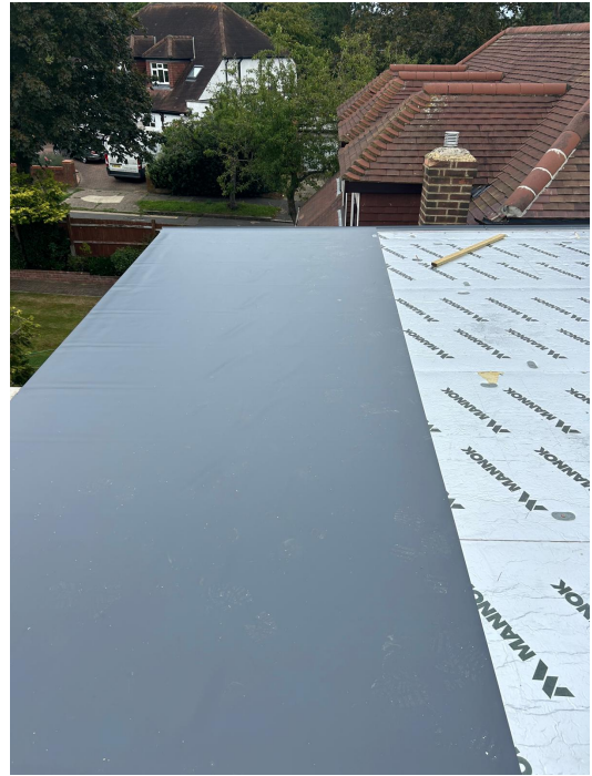
Roof surface condition / progress view IMG-20260218-WA0038.jpg