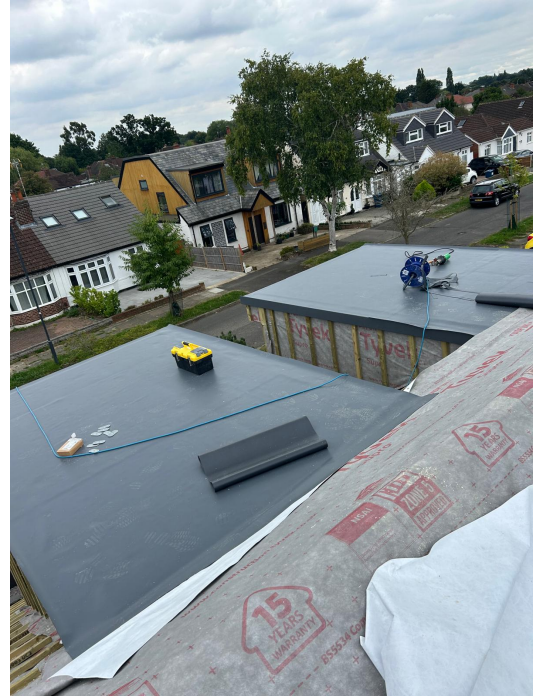
Perimeter detail IMG-20260218-WA0040.jpg