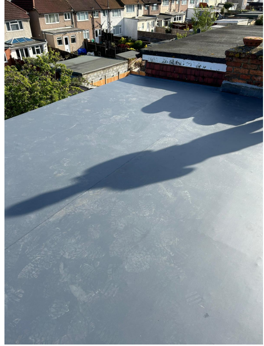
Perimeter detail IMG-20260218-WA0032.jpg