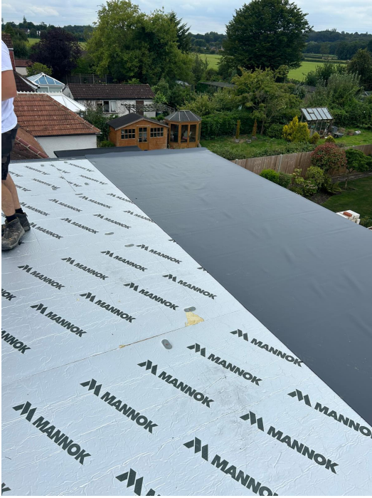
Completed membrane area IMG-20260218-WA0039.jpg