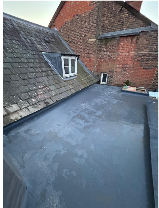
Edge / upstand detail IMG-20260218-WA0026.jpg