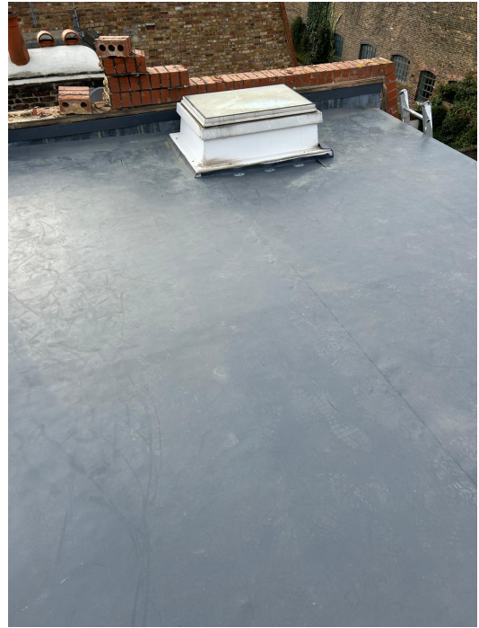
Progress view IMG-20260218-WA0028.jpg