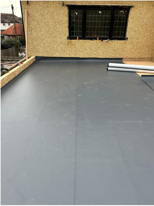
Completed membrane area IMG-20260218-WA0023.jpg