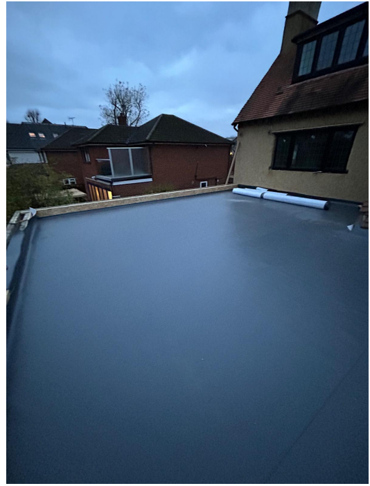
Perimeter detail IMG-20260218-WA0024.jpg