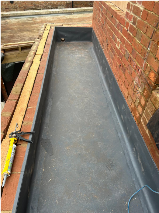
Completion overview IMG-20260218-WA0027.jpg