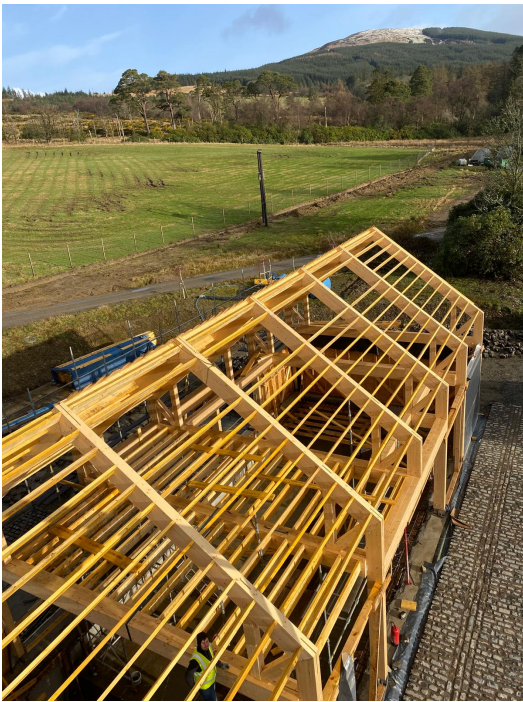
Upper-level room view IMG-20260219-WA0031.jpg