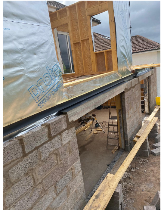
Internal loft structure IMG-20260219-WA0030.jpg