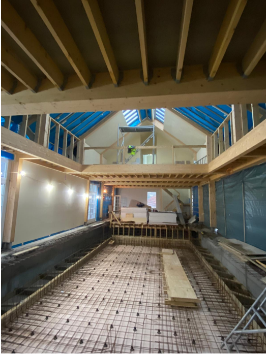
Eaves / roofline detail IMG-20260219-WA0033.jpg