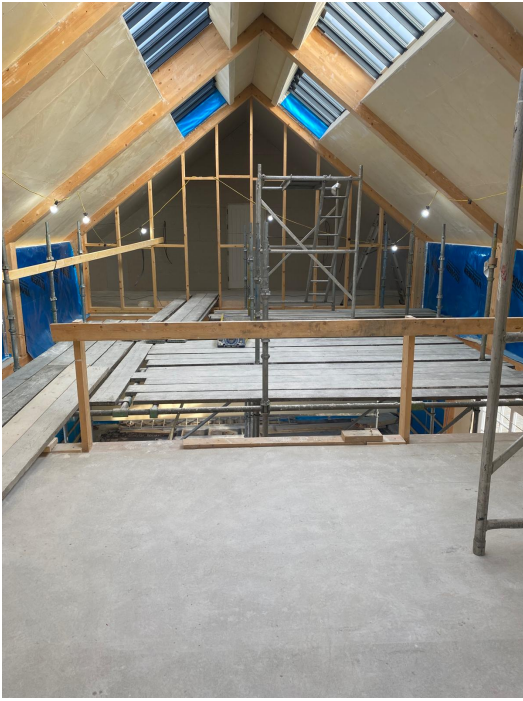
Roof build-up stage IMG-20260219-WA0029.jpg