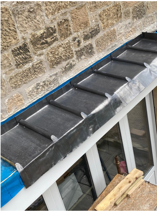
Eaves / roofline detail IMG-20260219-WA0027.jpg