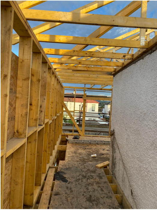
Upper-level room view IMG-20260219-WA0025.jpg