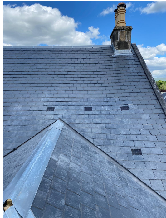
Internal loft structure IMG-20260219-WA0024.jpg