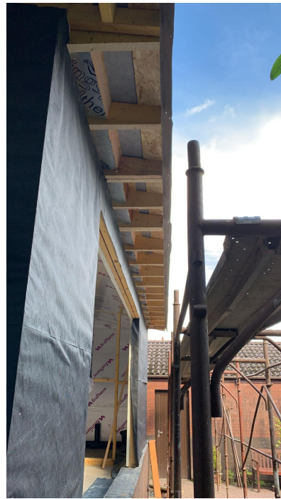
Enclosure progress IMG-20260219-WA0028.jpg