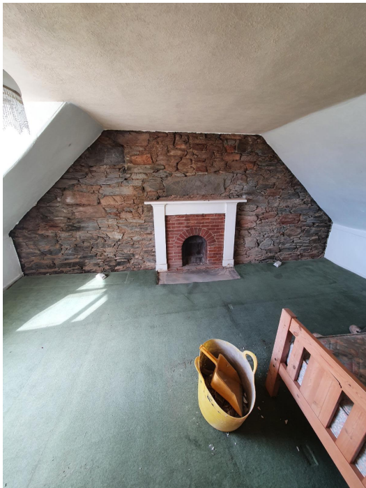
Roof build-up stage IMG-20260219-WA0023.jpg