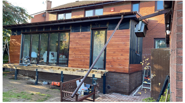
External progress view IMG-20260219-WA0026.jpg